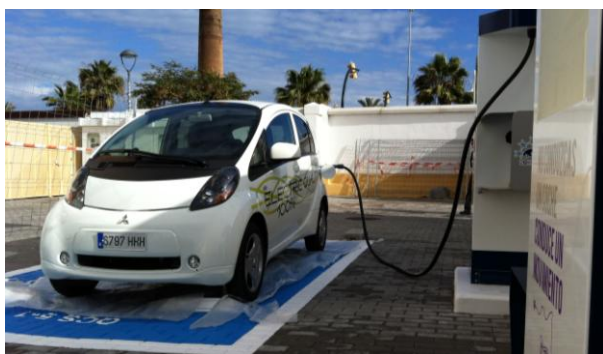
Fig1: EV and quick charger

※3) Ayesa Ingeniería y Arquitectura, S. A.