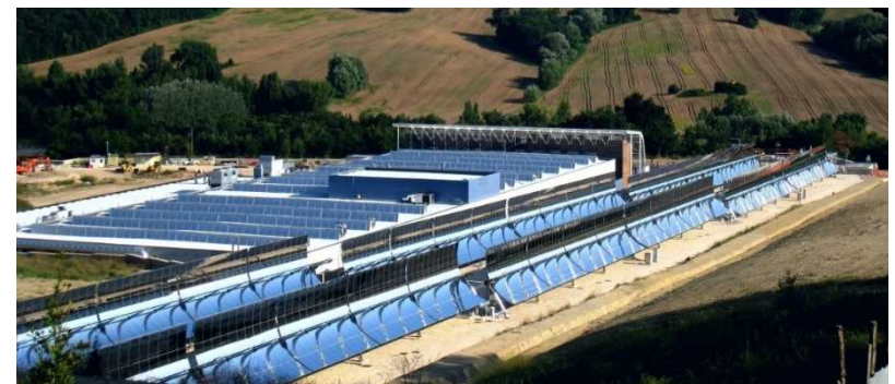
Chiyoda demonstration plant in Italy