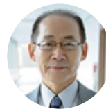
Hoesung Lee (Moderator)