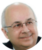
Ismail Serageldin (Moderator)

The discussions in this session stressed the need to address agriculture and food production as important as reducing fossil fuels when discussing climate change. The discussion of food loss included post-production and post-harvest waste, and recommended a review of food expiration dates and labeling in developed countries.