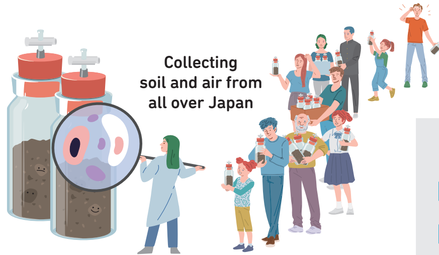
Collecting soil and air from all over Japan

Rhizobia are amazing, but they can only reduce N 2 O on the roots of leguminous plants. Reducing all types of agricultural N 2 O means finding microbes that are not dependent on legumes.